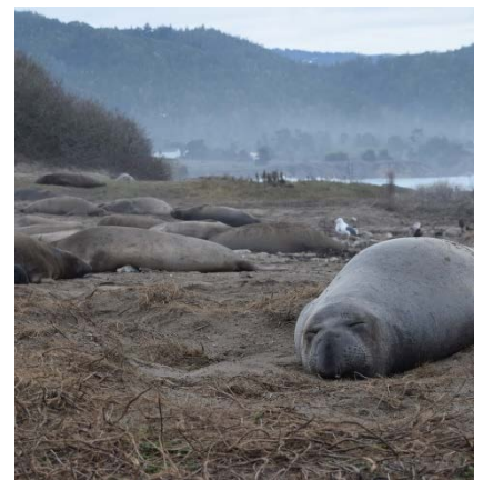
California State Railroad Museum in Sacramento (left), Providence Mountains State Recreation Area in San Bernardino County (center), Año Nuevo State Park in San Mateo County (right).