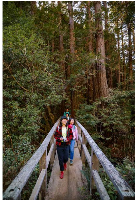
Julia Pfeiffer Burns State Park.